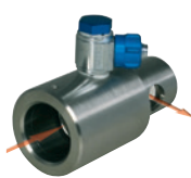
90° Mirror (with Air Purge)