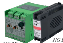
NG 2D NG DC Power Supplies