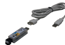
Converter RS485 to USB