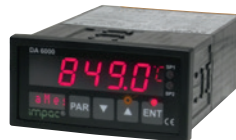
LED Digital Display DA 6000